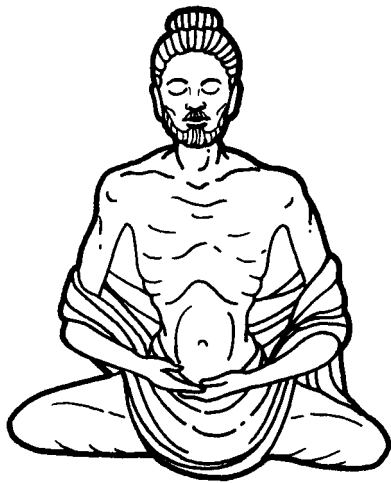
The Starving Prince Siddhartha

The images of Buddha, or rupas , are many, each with its own significance. In many representations Buddha has a halo around his head, a symbol of divinity. He is also shown with a topknot of hair which signifies his superior wisdom. In each figure, his position is related to his actions—teaching, blessing, or meditating. As you will see, even his hand gestures, or mudras , have become traditional gestures.