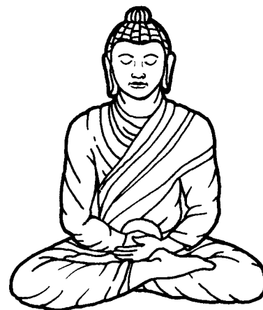
Full Lotus Position for Meditation