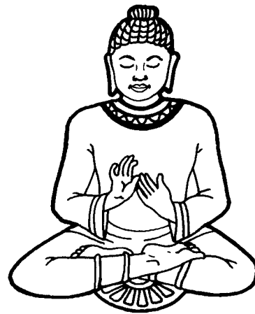
Lotus Pose, Hands in Teaching Position