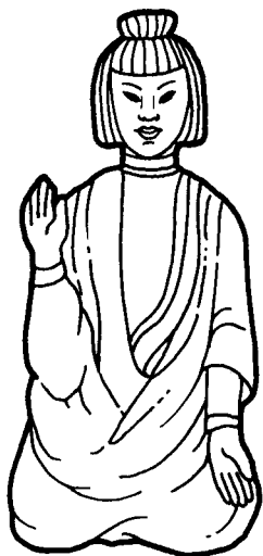
Japanese Buddha Dressed as Monk