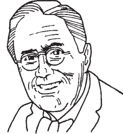
Franklin D. Roosevelt